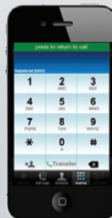
uMobility Fixed Mobile Convergence