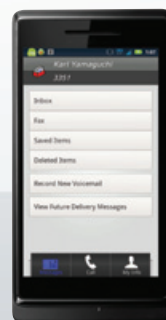
IPMobility Enables a smartphone to act as an extension of the office desk phone

Use Your Smartphone to Learn More About The Power of Choice!