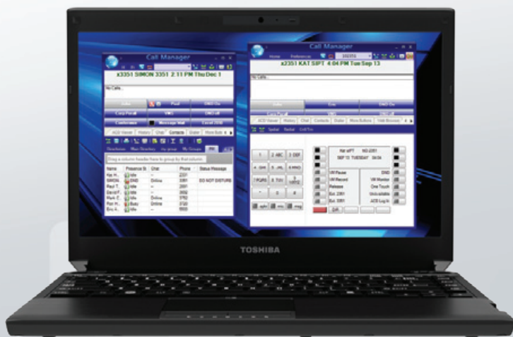
Toshiba's Call Manager Call Control from PCs

Toshiba knows employees are becoming more mobile and that your workplace can be an airport gate area, a tradeshow booth, a branch location, a home office, a Wi-Fi® spot, or wherever you connect to your remote network. Our award-winning IP telephone systems* allow you to be productive and accessible anywhere, just as if you are at your desk.