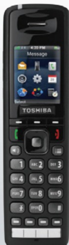
IP4100 Wireless SIP DECT Phone